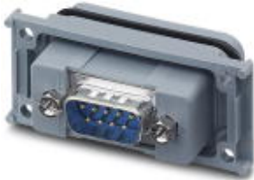
D-SUB panel mounting frame, shell size 1, with nine signal contacts, pin, gender changer, shielded, IP67 degree of protection

Please be informed that the data shown in this PDF Document is generated from our Online Catalog. Please find the complete data in the user's documentation. Our General Terms of Use for Downloads are valid ( http://download.phoenixcontact.com )