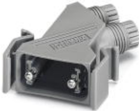
D-SUB sleeve housing, shell size 2, IP67 degree of protection

Please be informed that the data shown in this PDF Document is generated from our Online Catalog. Please find the complete data in the user's documentation. Our General Terms of Use for Downloads are valid ( http://download.phoenixcontact.com )