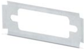
D-SUB EMC shroud, shell size 2, shielded, for panel mounting frame VS-15-...

Please be informed that the data shown in this PDF Document is generated from our Online Catalog. Please find the complete data in the user's documentation. Our General Terms of Use for Downloads are valid ( http://download.phoenixcontact.com )