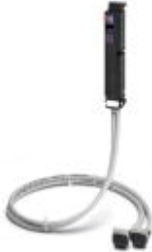
VIP-VARIOFACE front adapter, with connected system cables for SIMATIC S7 300, 2 x 8 channels can be connected, cable length: 1.5 m

Please be informed that the data shown in this PDF Document is generated from our Online Catalog. Please find the complete data in the user's documentation. Our General Terms of Use for Downloads are valid ( http://download.phoenixcontact.com )