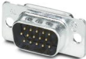
D-SUB contact insert, shell size 1, with 15 signal contacts, contact type pin, with solder cup, straight, fixing with a 3 mm hole, for panel mounting frame VS-09-...

Please be informed that the data shown in this PDF Document is generated from our Online Catalog. Please find the complete data in the user's documentation. Our General Terms of Use for Downloads are valid ( http://download.phoenixcontact.com )