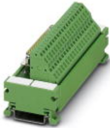
VARIOFACE module, with spring-cage connection and D-Subminiature pin strip, for mounting on NS 35/7.5, 9-pos.

Please be informed that the data shown in this PDF Document is generated from our Online Catalog. Please find the complete data in the user's documentation. Our General Terms of Use for Downloads are valid ( http://download.phoenixcontact.com )