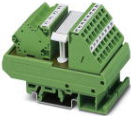
VARIOFACE module, with two equipotential busbars (P1, P2) for potential distribution, for mounting on NS 32 or on NS 35/7.5

Please be informed that the data shown in this PDF Document is generated from our Online Catalog. Please find the complete data in the user's documentation. Our General Terms of Use for Downloads are valid ( http://download.phoenixcontact.com )