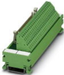
VARIOFACE module, with spring-cage connection and flat-ribbon cable connector, for mounting on NS 35/7.5, 26-pos.

Please be informed that the data shown in this PDF Document is generated from our Online Catalog. Please find the complete data in the user's documentation. Our General Terms of Use for Downloads are valid ( http://download.phoenixcontact.com )