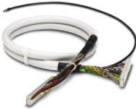
Assembled shielded round cable, with two 14-pos. female connectors (1:1 connection), for connecting 8 channels, length: 2 m

Please be informed that the data shown in this PDF Document is generated from our Online Catalog. Please find the complete data in the user's documentation. Our General Terms of Use for Downloads are valid ( http://download.phoenixcontact.com )