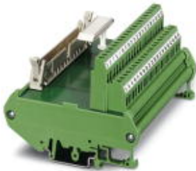
VARIOFACE interface module for Siemens SIMATIC® S7-300, with SIMATIC®-specific labeling (1 - 40), with screw connection, module width: 113 mm

Please be informed that the data shown in this PDF Document is generated from our Online Catalog. Please find the complete data in the user's documentation. Our General Terms of Use for Downloads are valid ( http://download.phoenixcontact.com )