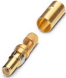
Coaxial contact, for D-SUB combination inserts, solder cup, pin, straight, for cable RG 58, gold-plated

Please be informed that the data shown in this PDF Document is generated from our Online Catalog. Please find the complete data in the user's documentation. Our General Terms of Use for Downloads are valid ( http://download.phoenixcontact.com )