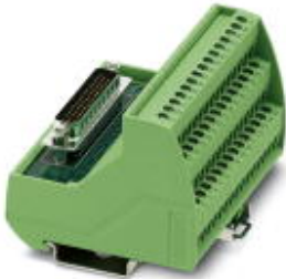
VARIOFACE module, with screw connection and high density D-SUB miniature pin strip, for mounting on NS 35 rails, no. of pos.: 26, width: 79 mm

Please be informed that the data shown in this PDF Document is generated from our Online Catalog. Please find the complete data in the user's documentation. Our General Terms of Use for Downloads are valid ( http://download.phoenixcontact.com )