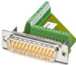
D-SUB contact insert, shell size 3, with 25 signal contacts, male contact type, screw connection, straight, for panel mounting frame and sleeve housing with IP67 protection

Please be informed that the data shown in this PDF Document is generated from our Online Catalog. Please find the complete data in the user's documentation. Our General Terms of Use for Downloads are valid ( http://download.phoenixcontact.com )