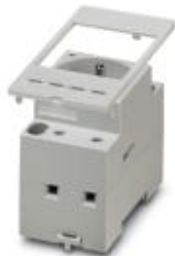
Ground contact socket, exclusively for service interface order no. 1656482 and 1656495, plastic, for France

Please be informed that the data shown in this PDF Document is generated from our Online Catalog. Please find the complete data in the user's documentation. Our General Terms of Use for Downloads are valid ( http://download.phoenixcontact.com )