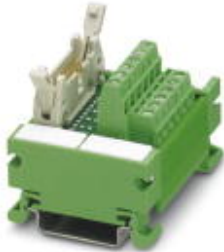
VARIOFACE COMPACT LINE, interface module for 8 channels, for assembly on DIN rail NS 35/7.5, screw connection

Please be informed that the data shown in this PDF Document is generated from our Online Catalog. Please find the complete data in the user's documentation. Our General Terms of Use for Downloads are valid ( http://download.phoenixcontact.com )