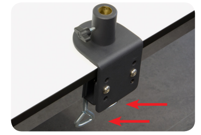
Choose position on table edge and tighten well the two screws.