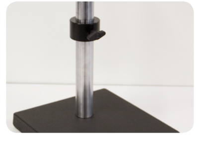
Mount the safety clamp to the column.