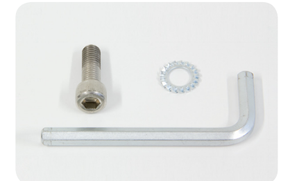
Allen key, washer and allen screw