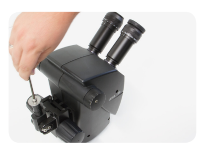
Remove allen screw and washer from the Leica A60 instrument as shown.