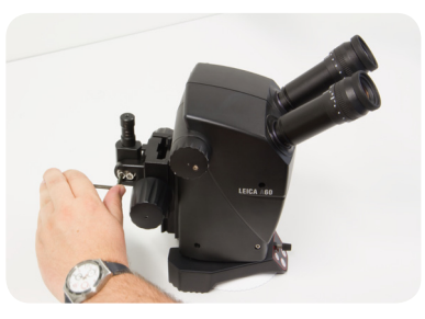
Open the two screws on the focus arm of the Leica A60...