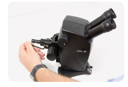
...and bring pin into horizontal position. Tighten screws again.