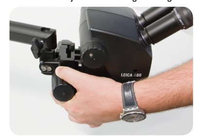
Mount the Leica A60 to the horizontal arm from below...