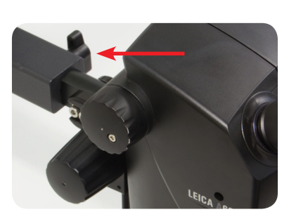
Attach Leica A60 to flex arm and tighten knob to secure the instrument.