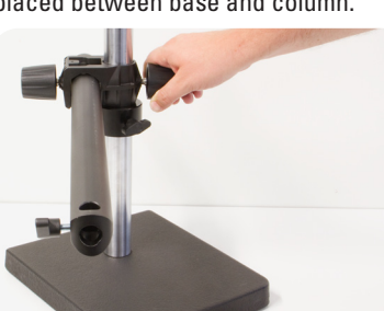
Place the cross joint on top of the safety clamp on the column and lock arm with referring knob.