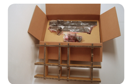
Box contains flex arm and table clamp.