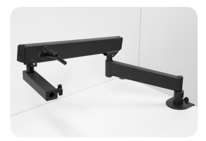
Insert arm into table clamp and tighten screw.