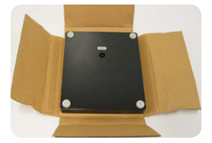
One box contains the base plate.