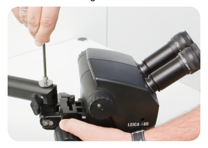
... and immediately secure the instrument with previously removed washer and screw.