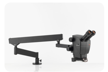
Your instrument is now ready for usage!