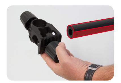
Insert horizontal arm into the cross joint observing the flattening of the arm and orientation of joint according to image.