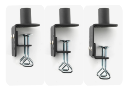
Pick one of three positions of the clamp according to table thickness.