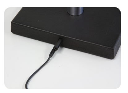
If necessary connect base plate to grounding cable with suitable plug.