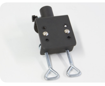
Take out table clamp from box.