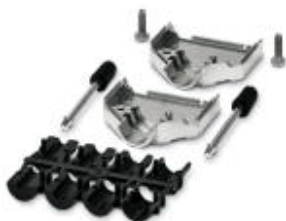
POWER-SUBCON cable housing, 5-pos.

Please be informed that the data shown in this PDF Document is generated from our Online Catalog. Please find the complete data in the user's documentation. Our General Terms of Use for Downloads are valid ( http://download.phoenixcontact.com )