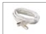
UC-210T 1.8m USB2.0 Cable x 1