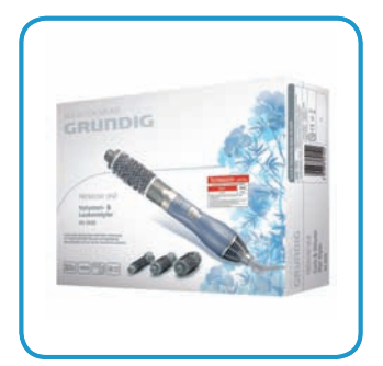
Model number HS 5523 Order number GMK 7920