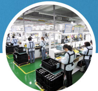
■ Production Line