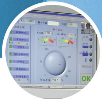
■ Automated Testing System