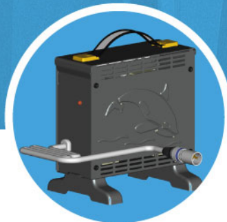
■ Charger Design