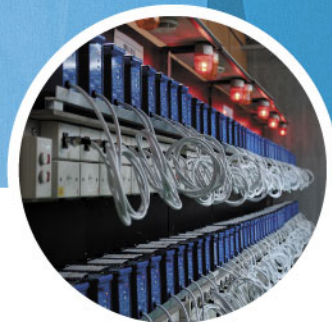
■ Burn-in Test