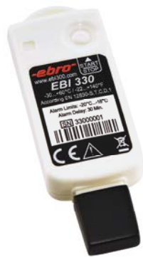
EBI 330-T30 Standard version