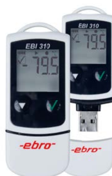
EBI 310 High precision version