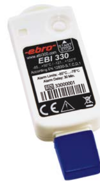
EBI 330-T85 Deep temperature version