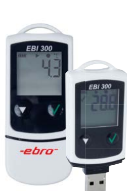
EBI 300 Standard version