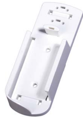
EBI 300-WM Wall Mount for EBI 300/310