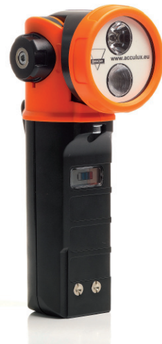
Fig. 1: Lamp HL 25 EX, Type 4584...