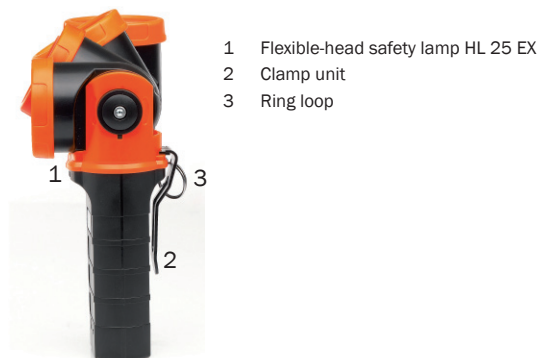
Fig. 2: Included in delivery HL 25 EX, Type 4584...