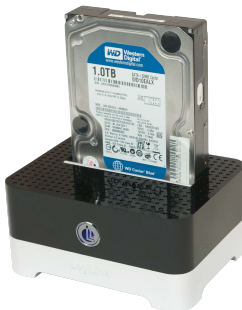
Install 3.5" HDD