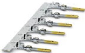
Crimp contact, Rolled, Single contact, Contact diameter: 1 mm, Crimp range: 0.22 mm 2 ...0.56 mm 2

Please be informed that the data shown in this PDF Document is generated from our Online Catalog. Please find the complete data in the user's documentation. Our General Terms of Use for Downloads are valid ( http://download.phoenixcontact.com )