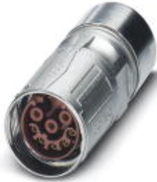
Cable connector, straight, SPEEDCON locking, M17, Number of positions: 8, Type of contact: Socket, Crimp connection, shielded: Yes, Cable diameter: 5 mm...9 mm

Please be informed that the data shown in this PDF Document is generated from our Online Catalog. Please find the complete data in the user's documentation. Our General Terms of Use for Downloads are valid ( http://download.phoenixcontact.com )