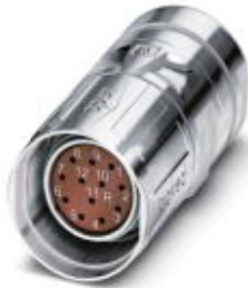
Cable connector, straight, shielded: Yes, SPEEDCON locking, M23, Number of positions: 12, Type of contact: Socket, Crimp connection, Cable diameter: 10 mm ... 14.5 mm

Please be informed that the data shown in this PDF Document is generated from our Online Catalog. Please find the complete data in the user's documentation. Our General Terms of Use for Downloads are valid ( http://download.phoenixcontact.com )