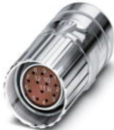
Cable connector, straight, shielded: Yes, Screw locking, M23, Number of positions: 12, Type of contact: Socket, Crimp connection, Cable diameter: 3 mm ... 14.5 mm

Please be informed that the data shown in this PDF Document is generated from our Online Catalog. Please find the complete data in the user's documentation. Our General Terms of Use for Downloads are valid ( http://download.phoenixcontact.com )