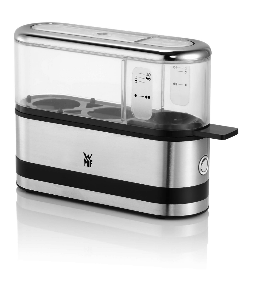
en Operating Manual