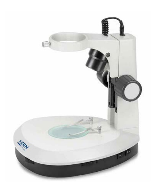
OZB-A5106 (Arm curved stand) with incident and transmitting illumination