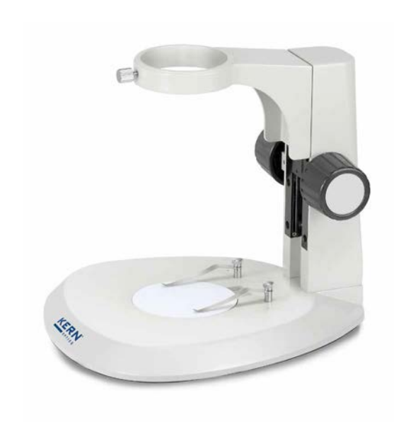
OZB-A5104 (Arm curved stand)