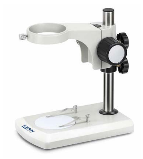
OZB-A5107 with extra small stage