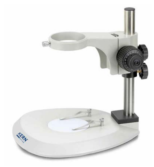
OZB-A5121 with coarse and fine adjustment