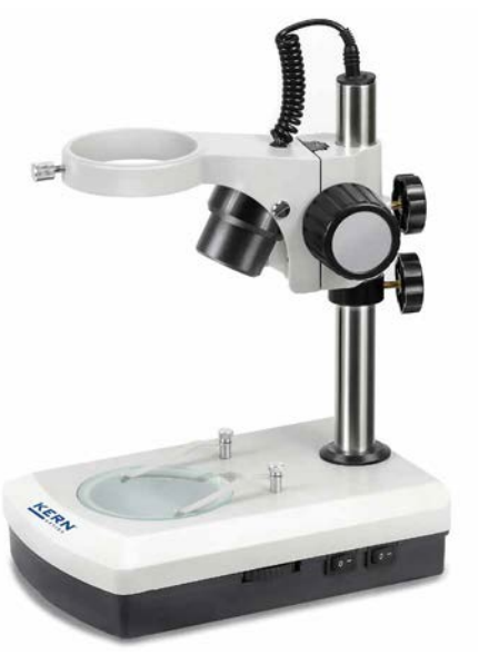
OZB-A5109 with extra small stage as well as incident and transmitting illumination