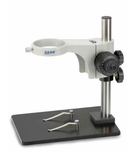
OZB-A5127 with coated steel stage as well as coarse and fine adjustment