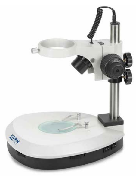
OZB-A5123 with coarse and fine adjustment as well as incident and transmitting illumination