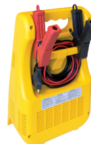
Cables and clamps stowage within the unit.