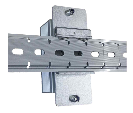
Figure 2. Device Mounted on a DIN Rail