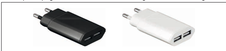
Fig.3: Travel chargers

This product is a USB charger for charging and operating with mobile devices by model-specific plug to USB. It transforms mains voltage into 5 Volt low voltage.