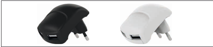
Fig.3: Travel chargers

This product is a USB charger for charging and operating with mobile devices by model-specific plug to USB. It transforms mains voltage into 5 Volt low voltage.