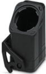
HEAVYCON EVO coupling housing, plastic, with bayonet flange for EVO screw connection, B6, with single locking latch, height: 90 mm, without EVO screw connection

Please be informed that the data shown in this PDF Document is generated from our Online Catalog. Please find the complete data in the user's documentation. Our General Terms of Use for Downloads are valid ( http://download.phoenixcontact.com )