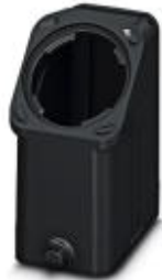
HEAVYCON EVO sleeve housing, plastic, with bayonet flange for EVO screw connection, B10, for single locking latch, height: 87.5 mm, without EVO screw connection

Please be informed that the data shown in this PDF Document is generated from our Online Catalog. Please find the complete data in the user's documentation. Our General Terms of Use for Downloads are valid ( http://download.phoenixcontact.com )