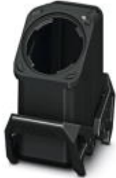
HEAVYCON EVO coupling housing, plastic, with bayonet flange for EVO screw connection, B10, with double locking latch, height: 90 mm, without EVO screw connection

Please be informed that the data shown in this PDF Document is generated from our Online Catalog. Please find the complete data in the user's documentation. Our General Terms of Use for Downloads are valid ( http://download.phoenixcontact.com )