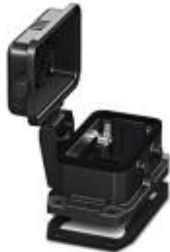
HEAVYCON EVO panel mounting base, plastic, B10, for double locking latch, height: 30.5 mm, with flat gasket, with protective cover

Please be informed that the data shown in this PDF Document is generated from our Online Catalog. Please find the complete data in the user's documentation. Our General Terms of Use for Downloads are valid ( http://download.phoenixcontact.com )