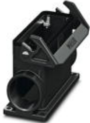
Box mounting bases B24, With single locking latch, Material: Polyamide, Cable outlets: 2, Lateral, Height: 84 mm, Cable gland: none, Gland: no, 2x M40, Standard

Please be informed that the data shown in this PDF Document is generated from our Online Catalog. Please find the complete data in the user's documentation. Our General Terms of Use for Downloads are valid ( http://download.phoenixcontact.com )