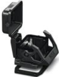
HEAVYCON EVO panel mounting base, plastic, B6, with single locking latch, height: 30.5 mm, with flat gasket, with protective cover

Please be informed that the data shown in this PDF Document is generated from our Online Catalog. Please find the complete data in the user's documentation. Our General Terms of Use for Downloads are valid ( http://download.phoenixcontact.com )