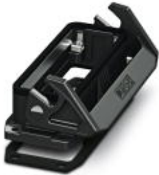
HEAVYCON EVO panel mounting base, plastic, B24, with single locking latch, height: 30.5 mm, with flat gasket

Please be informed that the data shown in this PDF Document is generated from our Online Catalog. Please find the complete data in the user's documentation. Our General Terms of Use for Downloads are valid ( http://download.phoenixcontact.com )