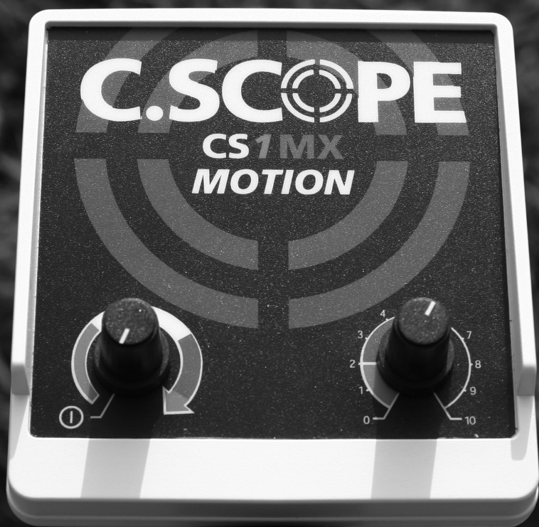
C.Scope CS1MX MOTION Metal Detector