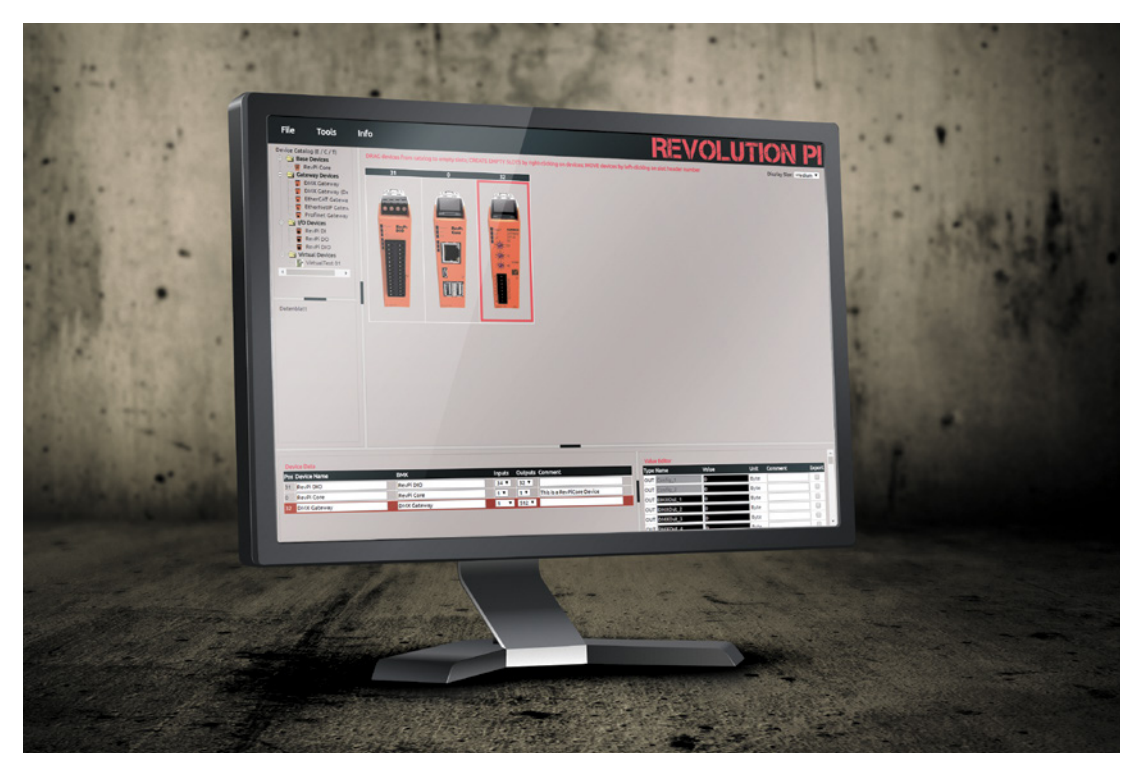
PiCtory helps you to set up your Revolution Pi system.

PiCtory also supports you when defining, for example, all I/O signals. You can assign symbolic names and define which adapter supplies and retrieves the data. An adapter can be a hardware module on the PiBridge but it can also be a "virtual device" – driver software for example – for which the memory location is reserved in the process image and for which process values can be defined with symbolic names. The finished configuration file is stored as a JSON file.