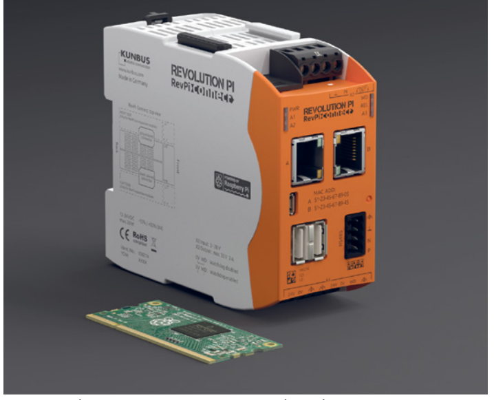
At 45mm, the RevPi Connect is twice as wide as the RevPi Core 3.

The RevPi Connect also has a 4-pole RS-485 interface on the front, for example to connect Modbus sensors.