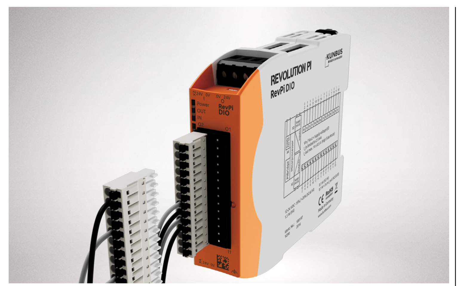
Digital I/O module RevPi DIO with 14 inputs and outputs.