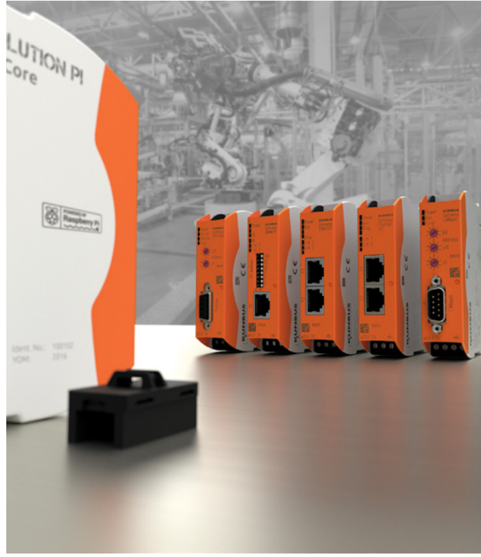
Available for all common industrial network protocols, the RevPi Gates help to integrate Revolution Pi into an industrial network.

In addition, the outputs can be configured so that an open load detection (line break) is also switched on and a corresponding alarm is transmitted to the RevPi Core for high-side output type. Just like the inputs, the outputs are also protected against static discharges, burst and surge impulses in accordance with EN61131-2 requirements.