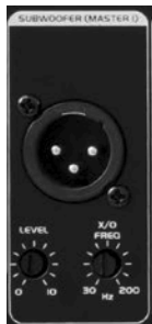
Mono subwoofer output with integrated active crossover