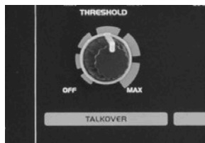
One-knob compressor and auto talkover per microphone channel