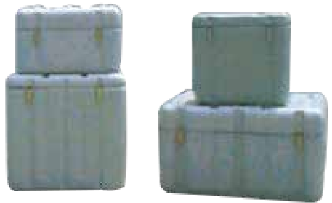
CAB 25 to CAB 240