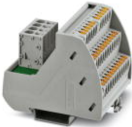
VARIOFACE module, with two equipotential busbars (P1, P2) for potential distribution, for mounting on NS 35 rails. Module width: 67.3 mm

Please be informed that the data shown in this PDF Document is generated from our Online Catalog. Please find the complete data in the user's documentation. Our General Terms of Use for Downloads are valid ( http://download.phoenixcontact.com )