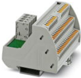
VARIOFACE module, with two equipotential busbars (P1, P2) for potential distribution, for mounting on NS 35 rails. Module width: 97.7 mm

Please be informed that the data shown in this PDF Document is generated from our Online Catalog. Please find the complete data in the user's documentation. Our General Terms of Use for Downloads are valid ( http://download.phoenixcontact.com )