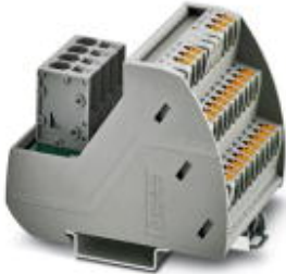
VARIOFACE module with push-in connection and two equipotential busbars (P1, P2) for potential distribution, for mounting on NS 35 rails. Module width: 57.1 mm

Please be informed that the data shown in this PDF Document is generated from our Online Catalog. Please find the complete data in the user's documentation. Our General Terms of Use for Downloads are valid ( http://download.phoenixcontact.com )