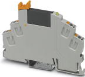
Pre-assembled solid-state relay module with push-in connection, consisting of: relay base with ejector and plug-in miniature solid-state relay. Input voltage: 24 V DC. Output: 3 - 33 V DC/3 A

Please be informed that the data shown in this PDF Document is generated from our Online Catalog. Please find the complete data in the user's documentation. Our General Terms of Use for Downloads are valid ( http://download.phoenixcontact.com )