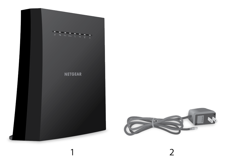
Figure 1. Extender package contents

Your package contains the following items.