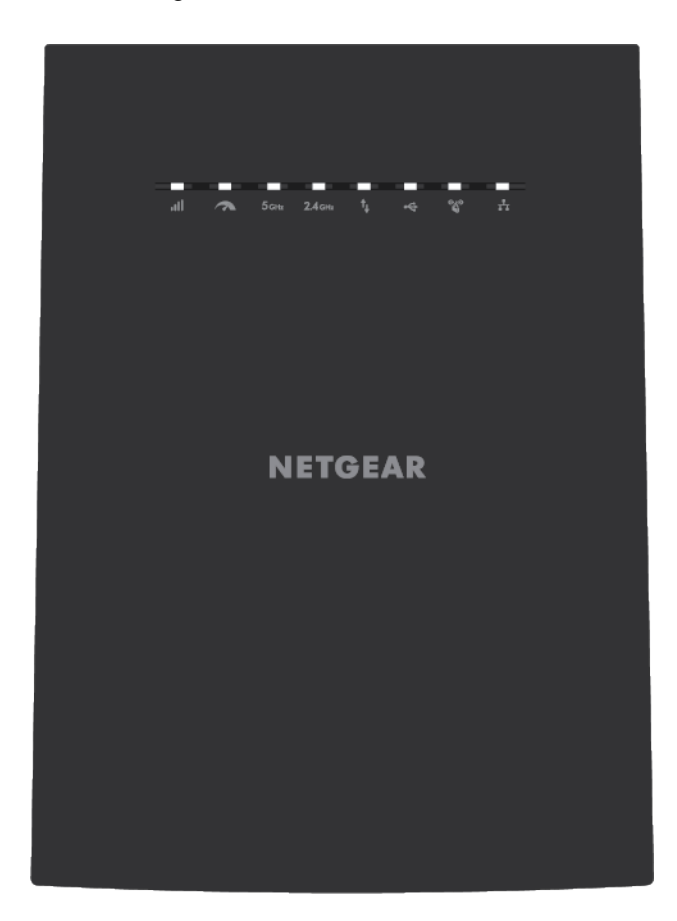
Figure 2. Front panel