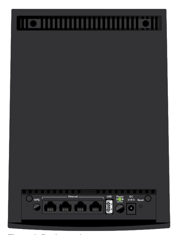
Figure 3. Back panel

The back panel of the extender provides ports, buttons, and a DC power connector.