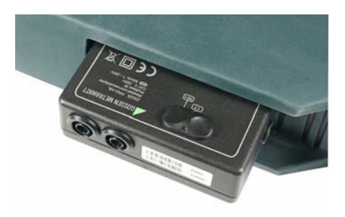
Figure 1: Leakage Current Measuring Adapter at the PROFITEST MXTRA

Before performing measurements, the adapter's measurement outputs must be plugged into the measurement inputs at the left-hand side of the PROFITEST MXTRA or SECULIFE IP (2-pole current clamp input and probe input).